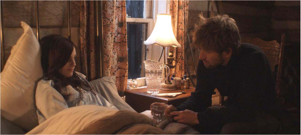
Georgina Reilly as Woman and Sean Clement as Man in A HINDU'S INDICTMENT OF HEAVEN. Indictment Films 2009